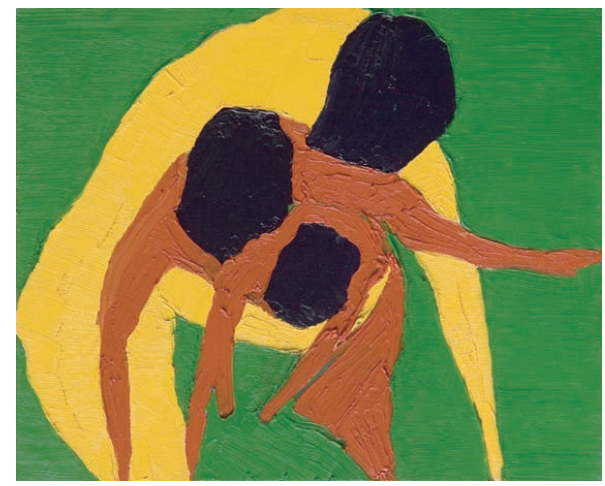
salvation, 2007, oil on canvas, 53.0 x 65.2cm

Graduated from Tokyo Zokei University, Department of Fine Arts, Painting in 2007. Major exhibitions include: Tokyo Wonder Wall 2005 (2005, Skywalk Exhibition Space at Tokyo Metropolitan Government, Tokyo); empty (2006, Gendai Heights Gallery Den, Tokyo). Recipient of the 2007 VOCA Encouragement prize.