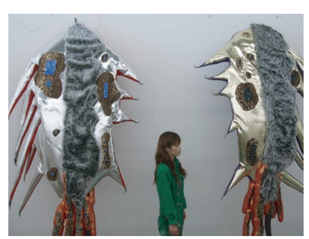
The World the Shining Ely Saw Upon Jumping into the Climax 2007, installation with video and mixed media, 200 x 258 x 103 cm

Graduated from Tokyo Zokei University, Department of Fine Arts, Painting in 2007. Major exhibitions include: solo show (2004, Gallery Ginza Forest, Tokyo); Five-person show (2003, Gallery Deco, Tokyo). Currently enrolled in the graduate program at Tokyo Zokei University.