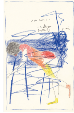
Adoration inflicts pain 2018, colour pencil on paper, 21 x 14.8 cm

Wako Works of Art is pleased to announce the solo exhibition At the edges of the cultivated land by the Dutch artist Henk Visch, which opens Friday, May 25, 2018, and runs through July 14, 2018. This will be Visch's seventh solo show with the gallery.