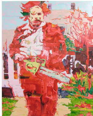
MASADA Takeshi Untitled 2006, oil on canvas, 110 x 92 cm